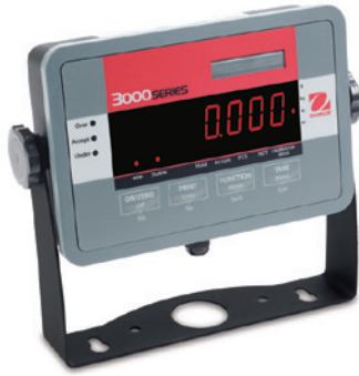
T32ME (LED version)